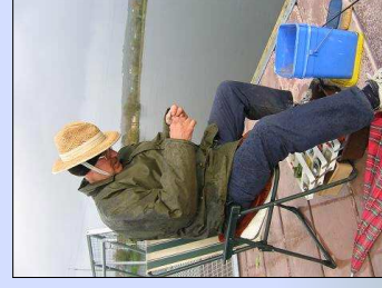
Coarse angler pictured at Newferry

115 out of the 946 people observed agreed to participate in the questionnaire survey. (71% male/29% female). The information they provided helps to build up an interesting picture of both recreational usage patterns and users attitudes to the river and its environs.